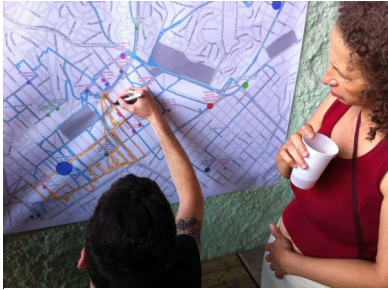
Figure 3. Participatory Design workshops, where the cooperative members would gather to review the collected data and prototypes, revealed many of the deeper social and political challenges with designing technology for their environments.

formal training, infrastructure, and commitment to obtain than with commercial logistics technologies. Such tools can be scaled down to their needs, minimizing costs so that they can compete on equal footing with private companies for contracts.