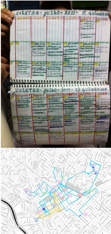
Figure 1. Top: Client pick-up schedule for a Sao Paulo recycling cooperative. Bottom: The same information mapped with our application, along with GPS traces of their collection routes by truck and hand-cart.

Urban and transportation planners are finding value in gathering such data across all logistics activities in cities, to understand the flow of urban freight and mitigate congestion or environmental impact. Methods for collecting these data have evolved from surveys, to traffic sensing at key nodes, and finally to sharing of GPS-generated location data between firms and governments [11]. GPS tracking of municipal solid waste trucks in Thailand allowed planners to detect population changes in dynamic immigrant neighborhoods, gaps in waste service that were filled by informal workers, and growing waste generation rates that would soon outpace their truck capacity [12].