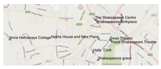
Figure 2. A map showing key tourist sites within Stratford upon Avon.

Figure 1. Mapping between a timeline and points of interest in Stratford upon Avon