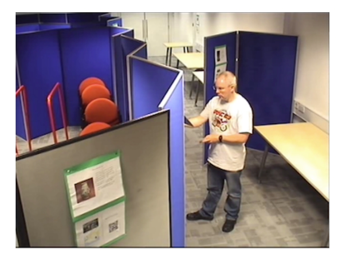
Figure 4. A virtual tourist scanning a QR code.

related images as well as some text, mainly taken from Wikipedia (figure 3). All selected tourist sites were related to Paris, if only by the sense that the mock scenario was a city tour of Paris. There were also four 'independently coherent' sub groups, each containing three points of interest (POIs) that were conceptually related. Group 1 POIs were related to 19<sup>th</sup> century Paris, Group 2 were all pottery items from different parts of the world, Group 3 items were artworks by Matisse and Group 4 were all places in Paris, but without any internal theme.